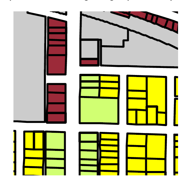
*The map below is the existing zoning map for the City of Owosso